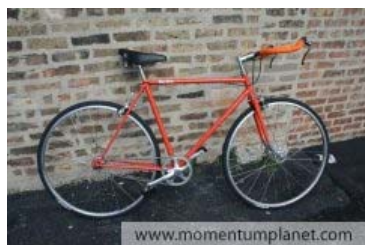
Each bike in the Big Shoulders' fleet is named after a Chicago historical figure. This Halloween-orange bike was named for 19th-century philanthropist Bertha Palmer.