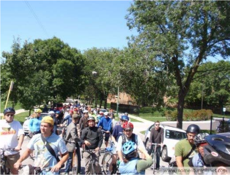
Ready to Roll: Cyclists gather for a recent ride sponsored by Chicago's Big Shoulders Realty.